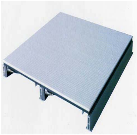
Full Aluminum Alloy Thermal-dissipated Structure